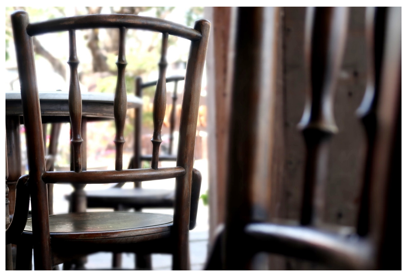
Frequently Asked Questions

Get answers to questions about specific topics, such as filing a Lacey Act declaration, revising a declaration, disclaiming products that are excluded from the requirements, Phase VII implementation, and more.