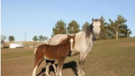
Federally Approved Livestock Markets Dashboard