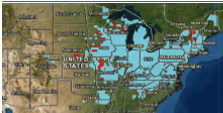
Imported Fire Ants Quarantine Map