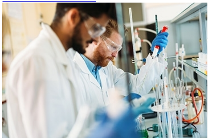
For State Veterinarian Offices