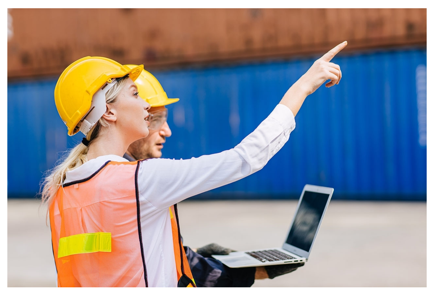
For Lab Technicians