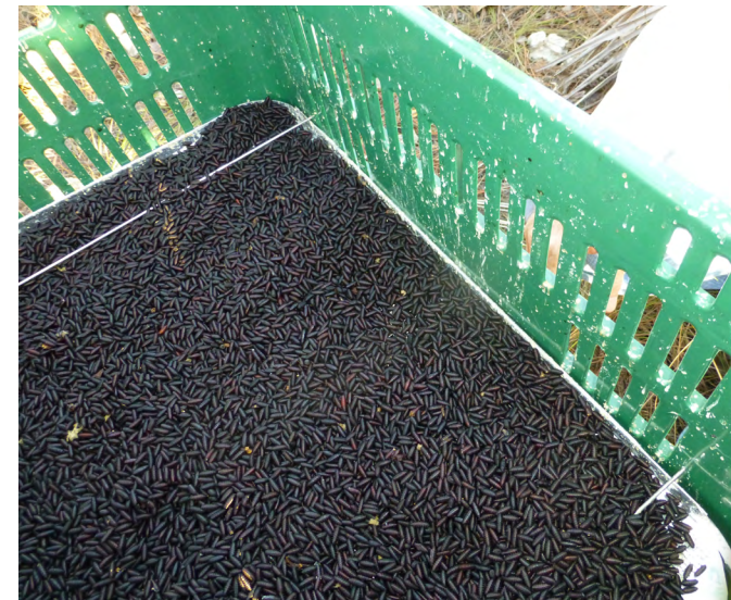
Sterilized NWS pupae released in infested area

To eradicate NWS, sterilized pupae may be placed in chambers at strategic locations throughout an infested area. Sterile flies may also be dispersed from aircraft over larger areas. As male flies emerge from the chambers, they seek out mates. Because female screwworm flies mate just once in their lifespan, the only eggs she will lay are not viable and will not develop into maggots. The population ultimately dies out as more sterile screwworm flies are released. The population of fertile screwworm flies dies off naturally over a few lifecycles.