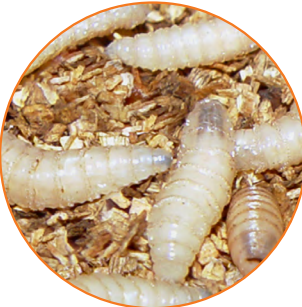
Magnified mature larvae