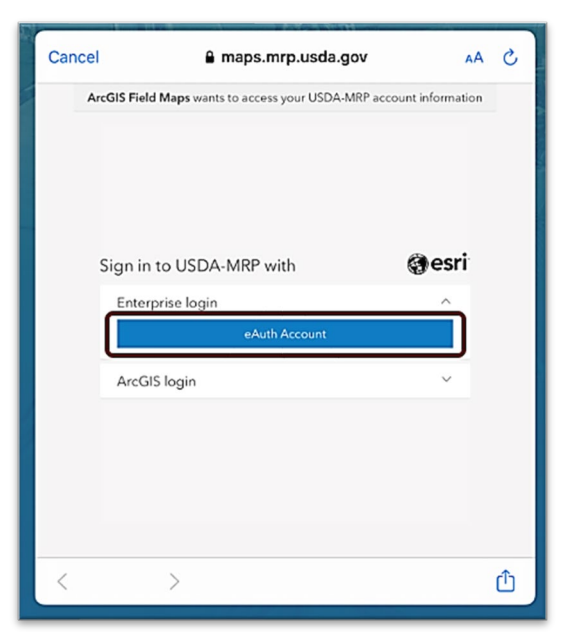
Figure 6. Sign in to USDA-MRP with eAuth Account

Again, choose the Enterprise login by tapping on the blue "eAuth Account" button. (Figure 6)