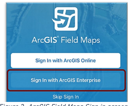
Figure 2. ArcGIS Field Maps Sign in screen

On first opening the application, you will have to add the ArcGIS Enterprise URL. Once established, your device saves this as a sign in option. The red box in Figure 3 indicates a saved URL and the yellow box in Figure 3 highlights the option to "Specify a New URL".