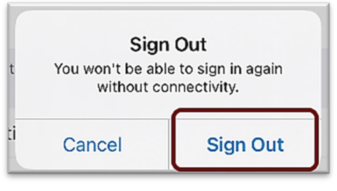
Figure 18. Sign out confirmation