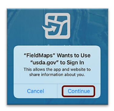
Figure 5. Confirm usda.gov sign in

Next you may be asked to confirm "usda.gov" to Sign In. Tap "Continue". (Figure 5)