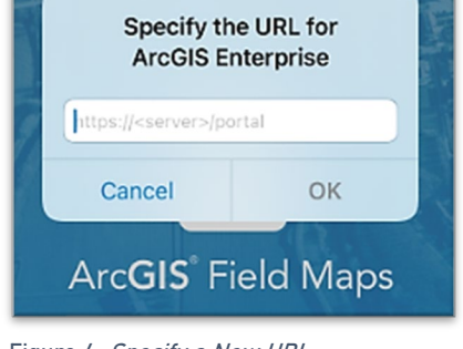
Figure 4. Specify a New URL

Next you may be asked to confirm "usda.gov" to Sign In. Tap "Continue". (Figure 5)