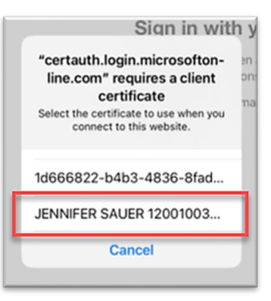
Figure 16. Select the certificate

You may need to tap and scroll to find the certificate listed with your name. Tap to select that line. (Figure 16)