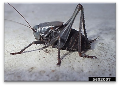
Florida Division of Plant Industry, Florida Department of Agriculture and Consumer Services, Bugwood.org

Program: Grasshopper / Mormon cricket (GHMC) Application: ArcGIS Field Maps Host: USDA-MRP GIS Enterprise (portal) Map Title: PPQ GHMC Surveys 2024 Field Map