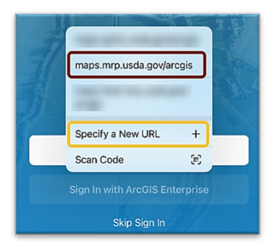
Figure 3. Sign in with ArcGIS Enterprise options

If choosing to "Specify a New URL", this is entered manually using the keyboard. Check it carefully and then tap "Ok". (Figure 4)