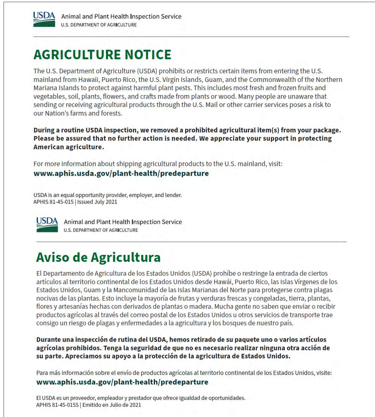
Figure A-12 Example of the Agriculture Notice

Issue an Agriculture Notice when a prohibited agricultural article is found and removed from a package. For ECO packages, place a copy of the Agriculture Notice in the package. For U.S. postal packages, place a copy of the completed PPQ Form 287, Mail Interception Notice and the Agriculture Notice in the package.