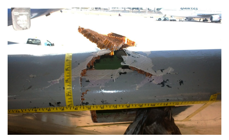
Figure 2. On average, about 38 wildlife strikes with U.S. civil aircraft are reported to the Federal Aviation Administration every day.

To comply with ICAO standards, the FAA mandates that airports in the U.S. initiate formal assessments of wildlife hazards, referred to as Wildlife Hazard Assessments (WHAs), when certain triggering events occur, such as a