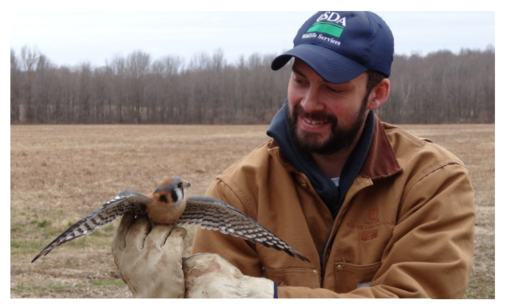
Figure 7. Translocation is a nonlethal option for managing raptors, such as this American kestrel, at airports.

of some species because of the potential to introduce wildlife diseases to new areas. Also, translocation is laborintensive and thus expensive (although costs have not been formally quantified), and relocated raptors sometimes return to the airport where they were captured. Furthermore, survival rates of translocated individuals are not well understood, and it is unclear how translocation affects established animal communities at relocation sites. In general, more research is needed before translocation can be used most effectively at airports.