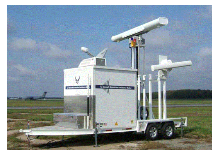
Figure 9. The FAA and several research partners in government (i.e., USDA, Department of Defense) and academia continue to investigate the capabilities of avian radar and its potential efficacy of use at airports.

There are several types of radar that have been used to monitor birds, including marine surveillance radars, tracking radars, weather surveillance radars, and terminal Doppler weather radars. Marine surveillance radars are most commonly modified for use at airports, which often are referred to as "avian radars". These usually have 3-cm