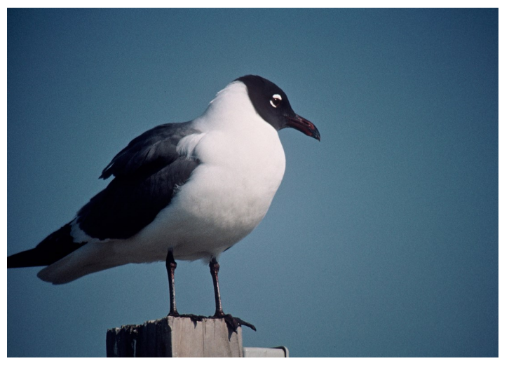
Figure 3. Most bird species in North America are federally protected under the Migratory Bird Treaty Act and their capture or lethal removal requires a permit. When implementing a Wildlife Hazard Management Plan, airport personnel must abide by relevant local, state and federal laws and regulations concerning birds and other natural resources.

One highly regulated activity at the state and federal levels is legal take (lethal removal) of wildlife. At the federal level, recommendations from USDA are required for the application process to obtain a migratory bird depredation permit administered by the Department of Interior (U.S. Fish and Wildlife Service; FWS). Permits are issued with strict guidelines and this process is identified in the Federal Code of Regulations. Data on wildlife use of the