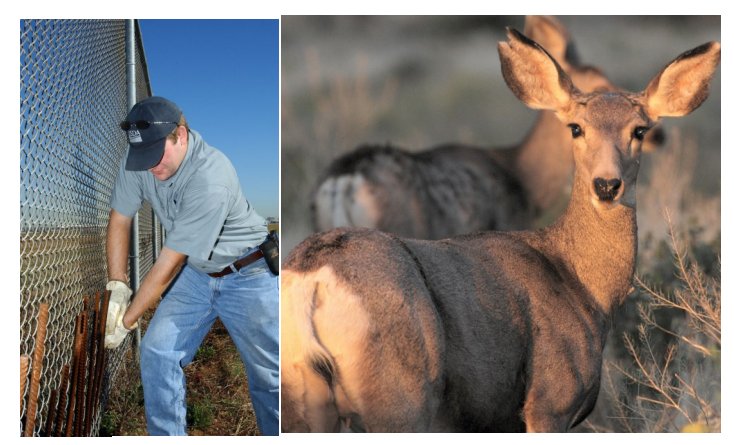
Figure 6. When well-maintained, 10-foot or higher chain-link fencing is extremely effective in excluding hazardous mammals, such as deer, from critical areas and is ideal for airport use.

Regardless of the type of fence and gates used at an airport, it is vital that they are checked regularly and that breaches are repaired as soon as they are discovered. Deer, coyotes, and other mammals hazardous to aircraft will quickly find and use fence gaps and holes. Furthermore, research conducted at the USDA, Wildlife Services, National Wildlife Research Center suggests that white-tailed deer will rarely attempt to jump an 8-ft (2.44m) fence, even when their lives are threatened. Thus, a well-maintained 8-ft (2.44-m) fence is generally more effective at excluding medium- and large-sized mammals from critical airport areas than a neglected 12-ft (3.66-m) fence. However, irrespective of fence height, it is unlikely that any airport fence will be completely mammal-proof. Whenever deer or other mammals hazardous to aircraft are found within airport perimeter fences, they should be removed immediately to eliminate the risk of damaging aircraft strikes.