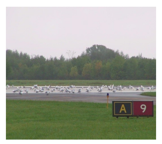
Figure 1. Gulls rest on an airport runway.

National Coordinator Airport Wildlife Hazards Program USDA-APHIS-Wildlife Services Washington, D.C.